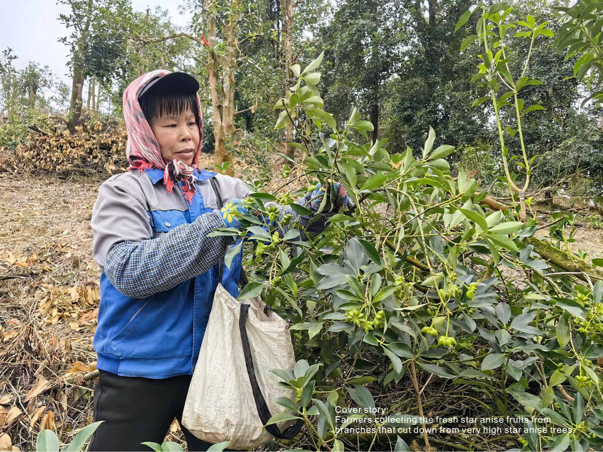
Cover story: Farmers collecting the fresh star anise fruits from branches that cut down from very high star anise trees.