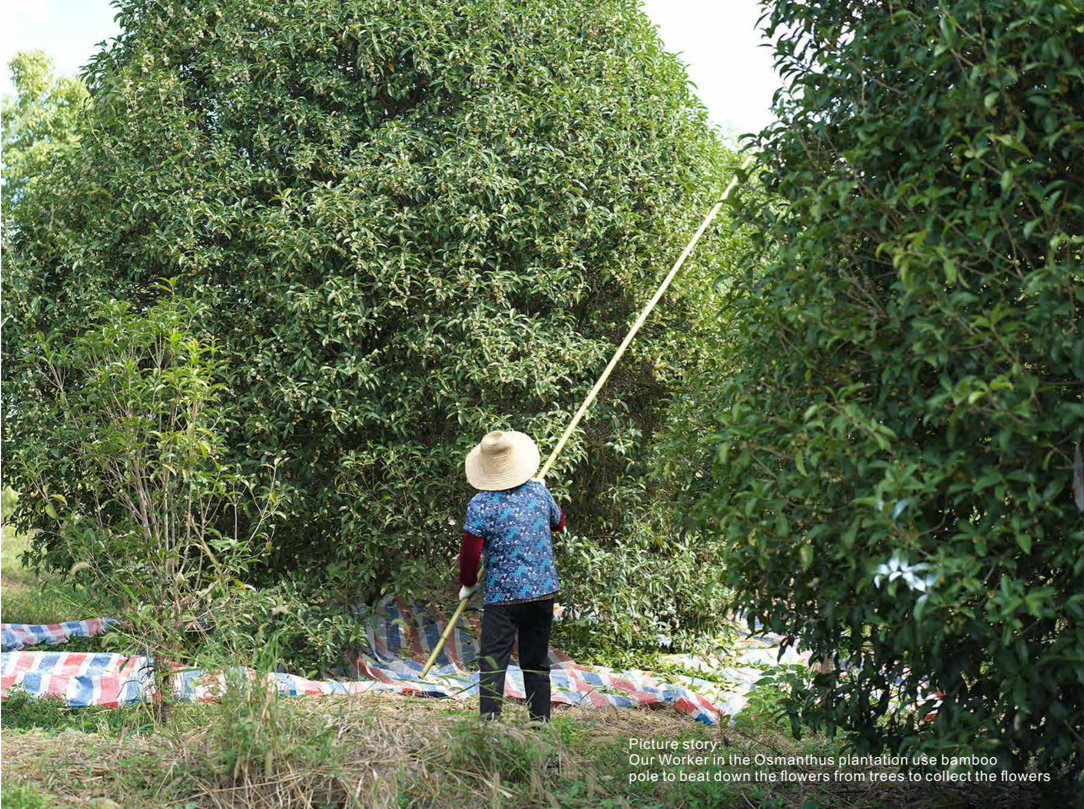
Picture story Our Worker in the Osmanthus plantation use bamboo pole to beat down the flowers from trees to collect the flowers